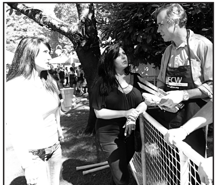
U.S. Sen. Jeff Merkley mingles with picnickers.