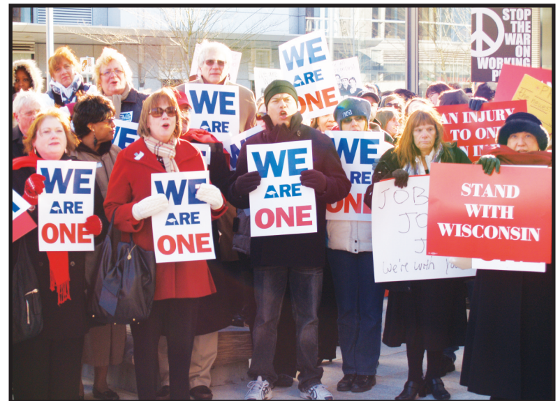
The “Spirit of Wisconsin” spread nationally, including this rally in Portland on Feb. 25, as workers fought to maintain their right to collective bargaining.

Meanwhile, wages are stagnant, regular unleaded is selling for $3.25 a gallon, and health care is more expensive