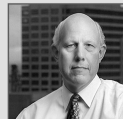
Nelson Hall • Personal Injury • Workers Compensation