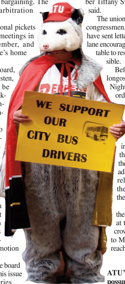
ATU's Pepper, the greed-fighting possum, walks an informational picket line prior to a TriMet board meeting.