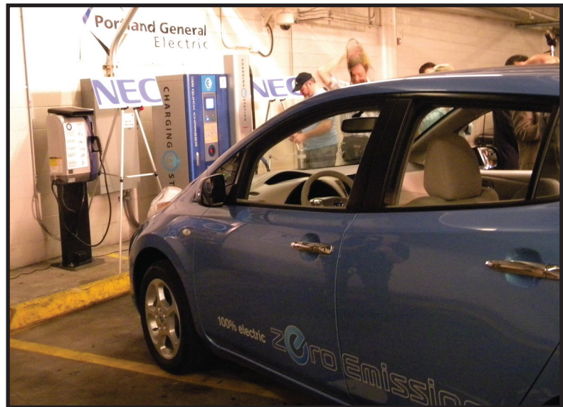
The first public-use electric vehicle charger in the country was installed by union electricians working at Hughes Electrical Contractors. The charging station is located at the World Trade Center parking garage in downtown Portland. Getting amped up for a test drive by Gov. Ted Kulongoski is a Nissan LEAF, an all-electric vehicle coming soon to the Portland market.

veiled. Nissan, the State of Oregon, and PGE have partnered in promoting and developing electric vehicles and charging stations.