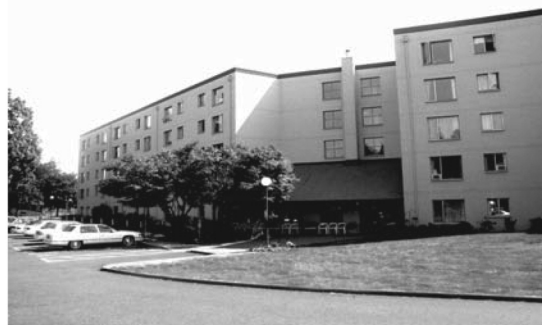
KIRKLAND UNION MANORS I,II,III Opened in 1980, 1985 & 1995