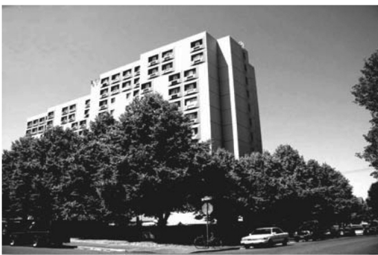
MARSHALL UNION MANOR Opened in January of 1974