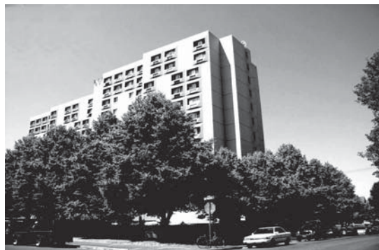
MARSHALL UNION MANOR Opened in January of 1974