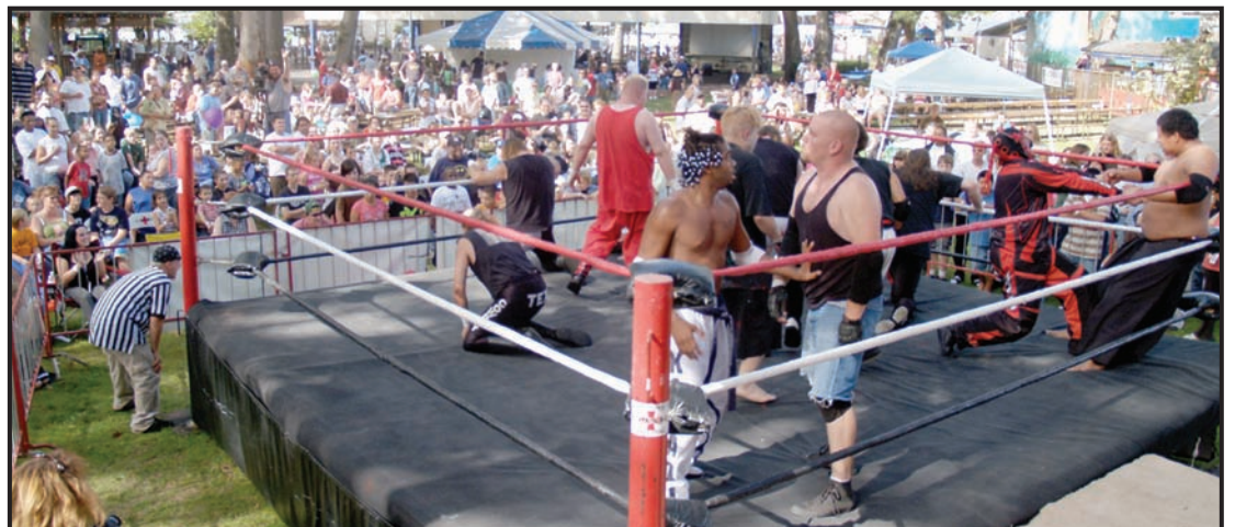
(BELOW) For the first time, entertainment also included professional wrestling. A 20-man "over the top battle royale" match capped the day's festivities. The event is promoted by Dr. Pain's Wrestling Clinic.