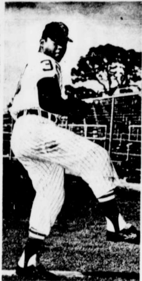
Juan Pizarro - White Sox

Pitching should tell the story on the Pale Hose. Outside of Juan Pizarro there are too many question marks... Early Wynn and Herb Score being the biggest. If these two can regain their form the White Sox are a definite threat. The acquisition of Joe Cunningham from the Cardinals will tighten the infield and Minoso's bat will not be missed.