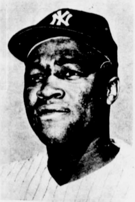
Elston Howard - Yanks