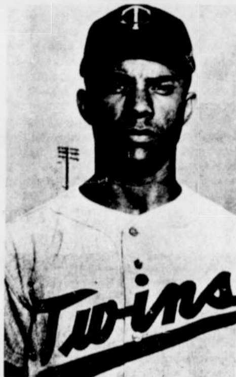
Zoilo Versalles - Twins

Pitching should tell the story on the Pale Hose. Outside of Juan Pizarro there are too many question marks... Early Wynn and Herb Score being the biggest. If these two can regain their form the White Sox are a definite threat. The acquisition of Joe Cunningham from the Cardinals will tighten the infield and Minoso's bat will not be missed.