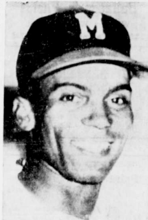
BILL BRUTON Speedy Braves Center Fielder

Woodley Lewis and Norman Van Brocklin will see action for the Rams. Both are ex-Oregon stars and have proven top pro grid performers. Lewis is rated as one of the best defensive backs in the professional circuit and Van Brocklin is acknowledged as one of the game's great posers.