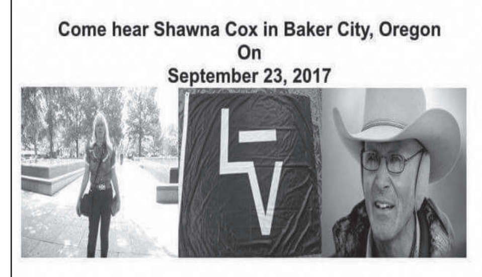
3:00 PM to 6:00 PM At the Geiser Grand, 1996 Main Street, Baker City, OR