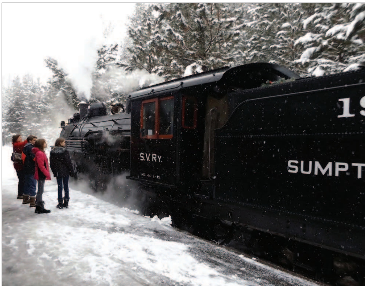
Meghan Andersch / The Baker County Press

Sumpter's Christmas train pulls up at McEwen Station.