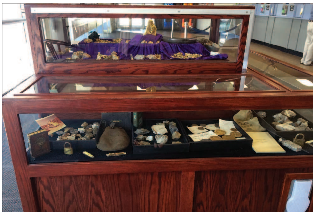
Samantha O'Conner / The Baker County Press

U.S. Bank's Baker City branch recently gave its famous Armstrong gold nugget (center, back) a new display case in the lobby.