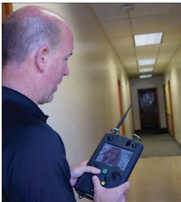
Kerry McQuisten / The Baker County Press

With a built-in camera and audio, the robot shows an armed suspect out of an officer's line of sight.