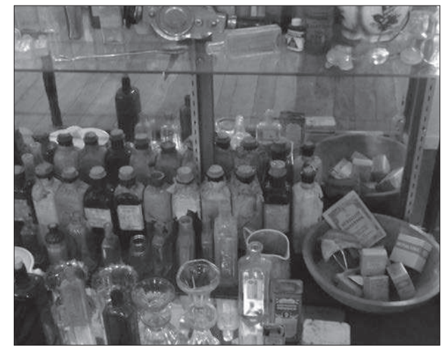
Meghan Andersch / The Baker County Press

The Sumpter Museum is undergoing a cleaning, rearranging and has this new display in the works.