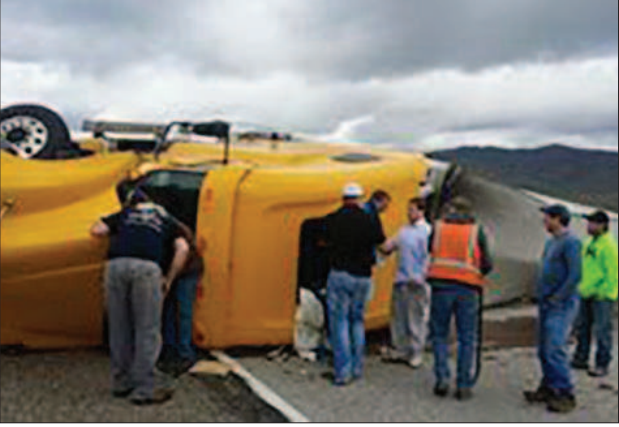
I-84 was shut down Tuesday afternoon from Pendleton to Ontario in both directions after two serious accidents.