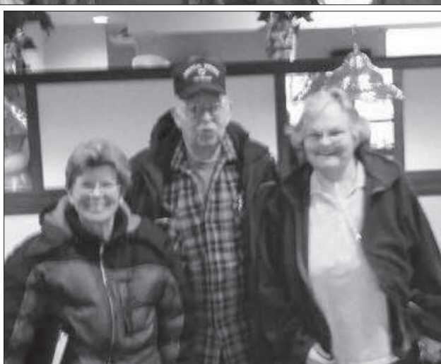
American Legion members hold a planning meeting at the Sunridge to discuss the organization's future.