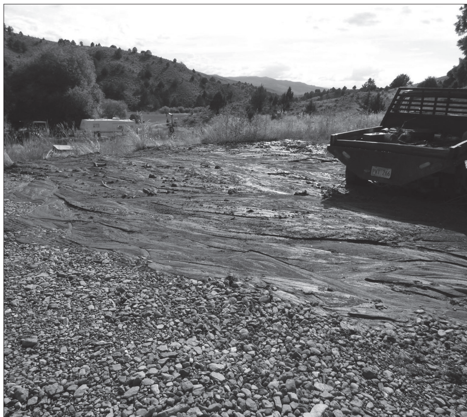
Submitted by Suzan Ellis Jones.

A flashflood Tuesday took out a garden and filled ditches with mud at the Devils Canyon Ranch in the Clark’s Creek area of Bridgeport. Just down the road, mud and rocks were reported in Burnt River Canyon, slowing down traffic there.