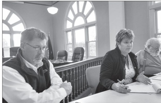
Gina K. Swartz / The Baker County Press

"We had participation from Ginger Savage for the crossroads building, The fire chief for the fire department building, the police chief for the police