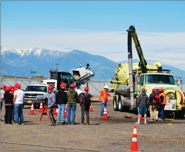
Students from the eastern Oregon region attended equipment demonstrations and career classes.

The students were accompanied by 33 chaperones, 46 ODOT volunteers helped plan and demonstrate how to use equipment, and 29 business and exhibitor volunteers providing equipment and hands-on activities and infor-