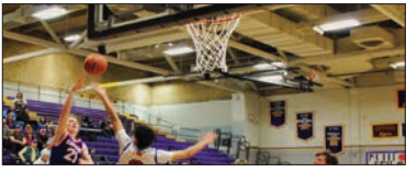
District Basketball Tournament —7