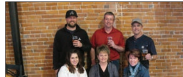
Lefty's Taphouse set to open —8