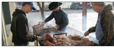
North Powder FFA barbecue fundraiser —9