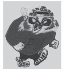
SCHOLAR ATHLETES POWDER VALLEY