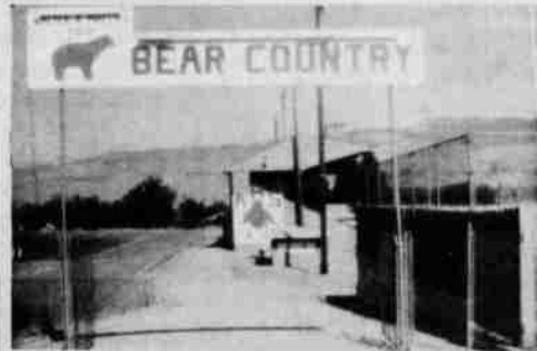
THE NEWEST addition to the high school is the sign above the football field. Welcome to Bear Country!!!