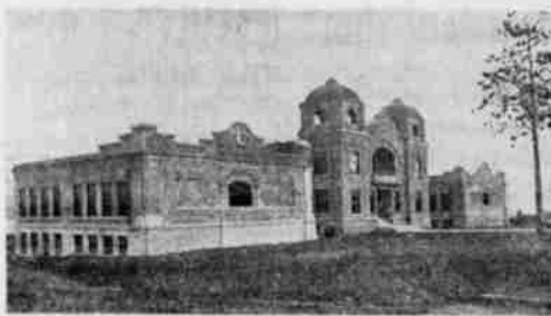
Ashland High School's present building as it stood originally, in 1911. Since that time, side doors and a new wing have been added.