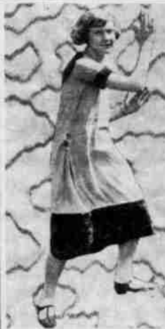
Dressed in a red and white ankle-length dress, this is the fashionable "cheer queen" of 1924.