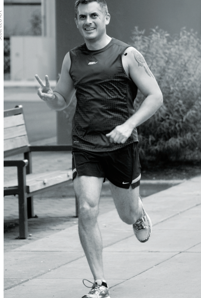
PORTLAND FRONTRUNNERS IS CELEBRATING THEIR 10TH ANNIVERSARY. The running club for lesbians, gays, bisexuals, transgender and queer individuals and their friends in Portland promotes good health and provides an opportunity for positive social interaction through running, walking and club events. Portland's chapter is one of over 100 Frontrunner organizations worldwide. portlandfrontrunners.org