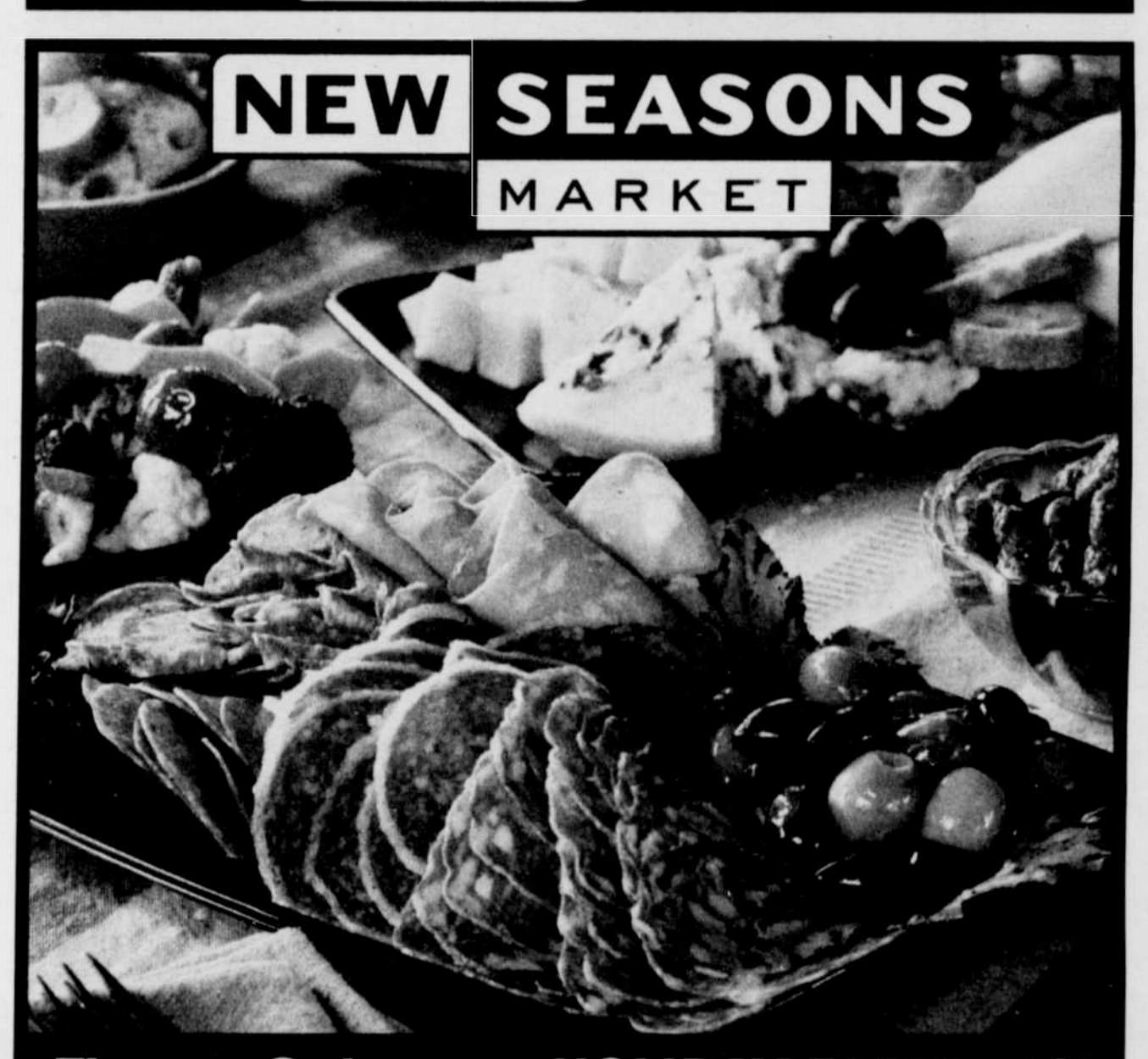
Time to Order your HOLIDAY PLATTERS!