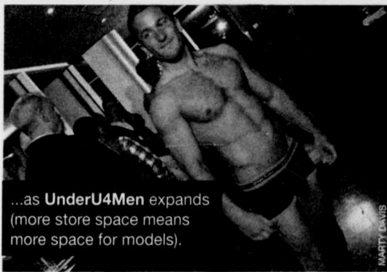
...as UnderU4Men expands (more store space means more space for models).

Finally, the home of one of Portland's longest operating gay bars was razed the week of August 1 with little fuss. The Dirty Duck Tavern closed in August 2009 after serving the bear and leather community for 25 years. The Portland Development Commission, which owned the property, ended the Duck's lease to build a new homeless