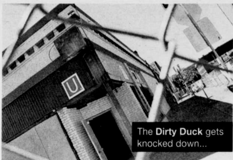
The Dirty Duck gets knocked down...

Late in the year, skivvies purveyor UnderU4Men announced the relocation and expansion of its downtown store, with plans for a new, 5,000-square-foot flagship space at 800 SW Washington in February 2012.