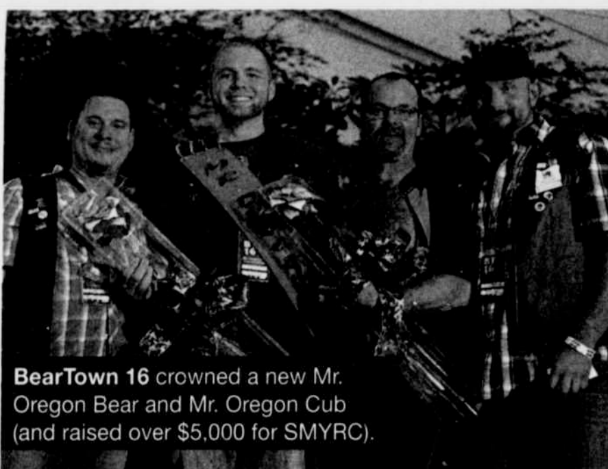
BearTown 16 crowned a new Mr. Oregon Bear and Mr. Oregon Cub (and raised over $5,000 for SMYRC).