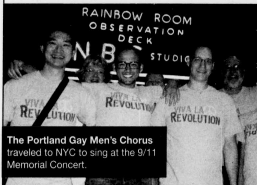
The Portland Gay Men's Chorus traveled to NYC to sing at the 9/11 Memorial Concert.