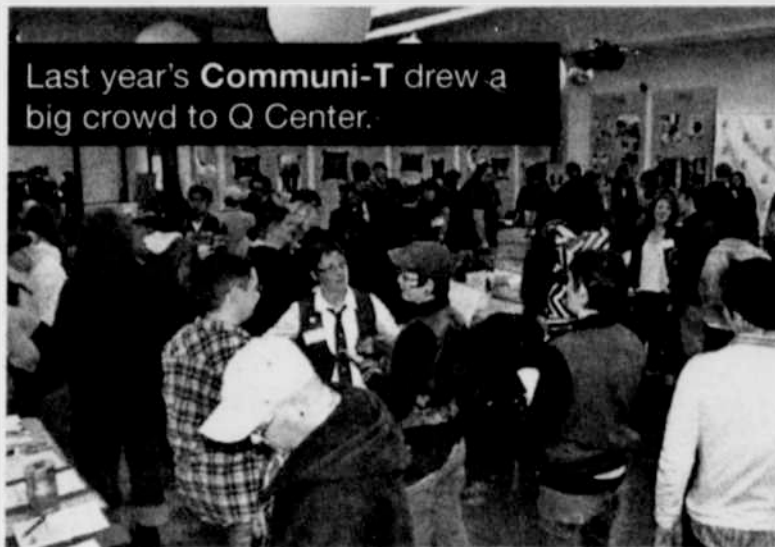
Last year's Communi-T drew a big crowd to Q Center.