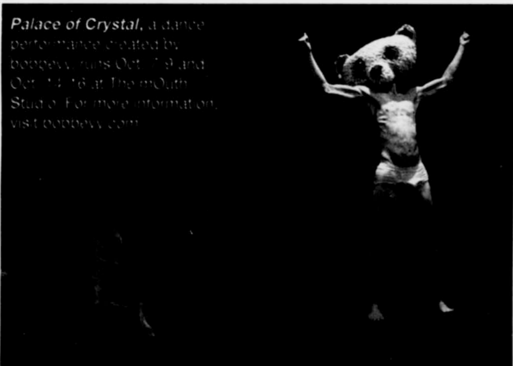
Palace of Crystal , a dance performance created by bebbey runs Oct. 7-9 and Oct. 14-16 at The Mouth Studio. For more information, visit bebbey.com

Check out up-to-date information on the queerest events in town by logging on to justout.com.