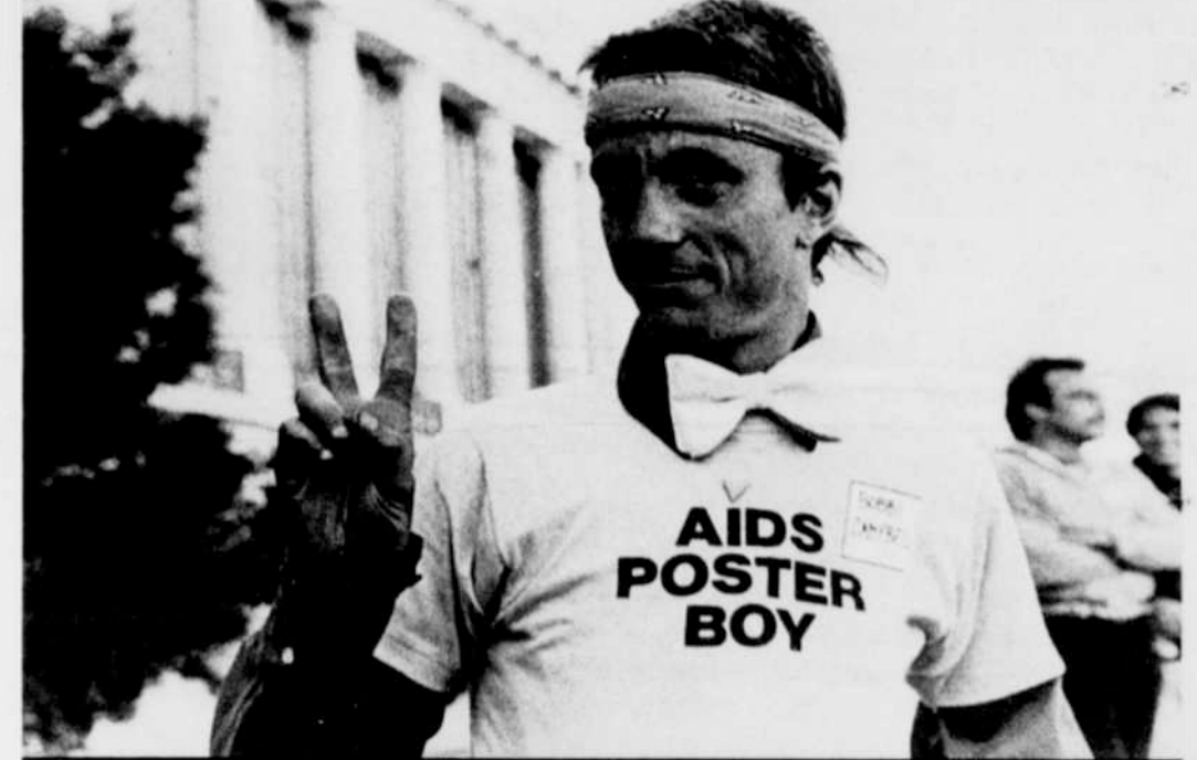
A still from We Were Here