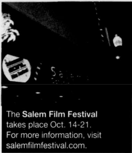
The Salem Film Festival takes place Oct. 14-21. For more information, visit salemfilmfestival.com .