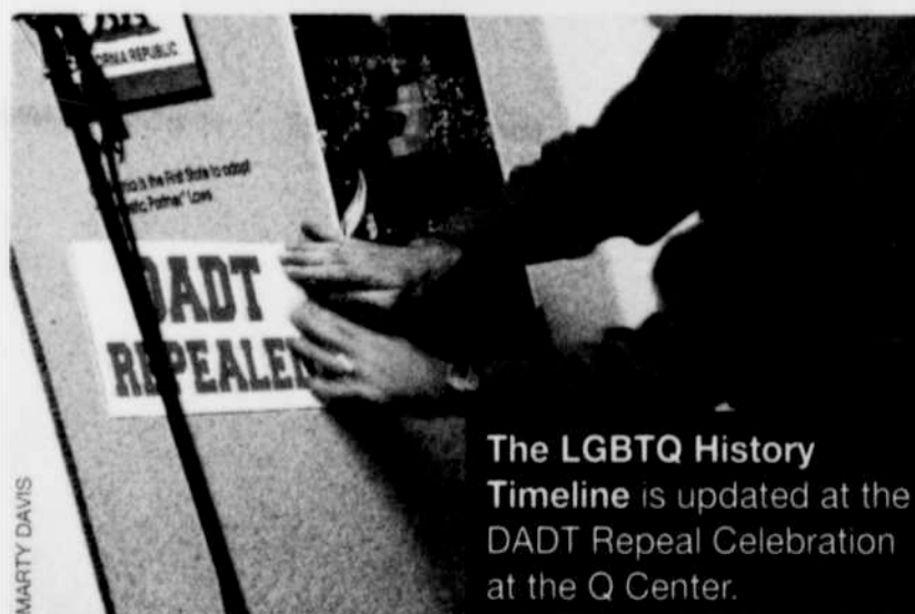
The LGBTQ History Timeline is updated at the DADT Repeal Celebration at the Q Center.