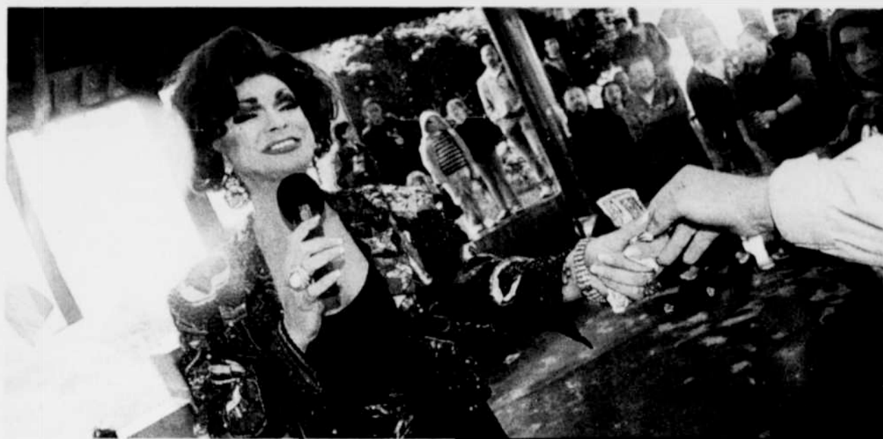
The sights from Iris Pride 2010

whom she met through Dykes on Bikes at Portland Pride—not only helped organize Friday's Drag-U-Licious show and Saturday's Dykes on Bikes breakfast, but are also opening their property to traveling bikers.