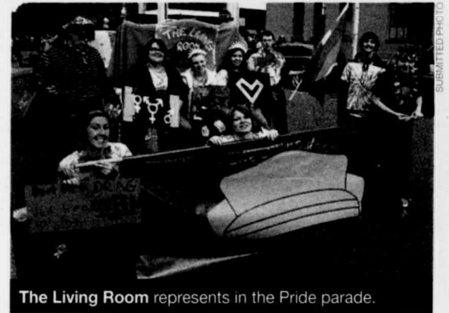
The Living Room represents in the Pride parade.

The party will be hosted at Oregon City's Ainsworth House by Seattle drag sensation Jinx Monsoon and will include performanc-