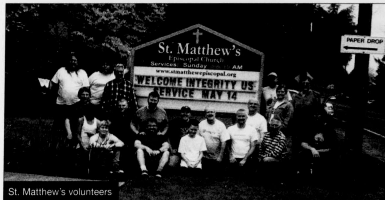
St. Matthew's volunteers

St. Matthew's Episcopal Church made headlines in March 2010 when the priest and a majority of the congregation voted to leave the Episcopal Church over disagreements stemming from the denomination's increasing acceptance of GLBT members. Following