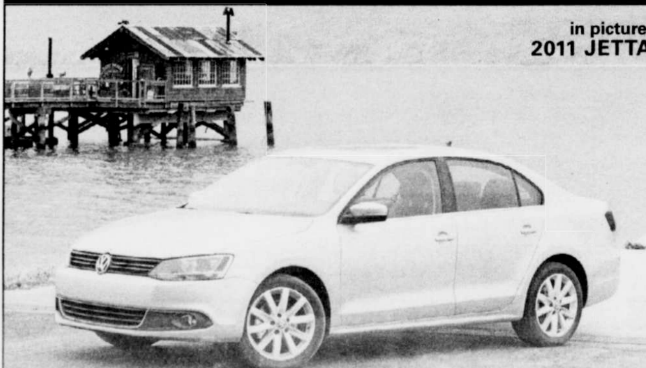
in picture: 2011 JETTA

OUR LARGEST SELECTION OF TDI MODELS EVER!