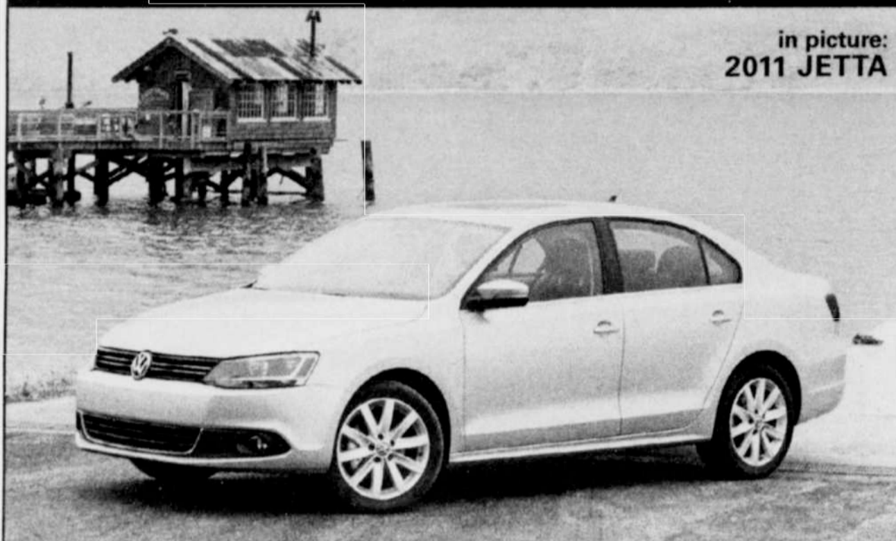
in picture: 2011 JETTA