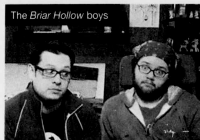
The Briar Hollow boys