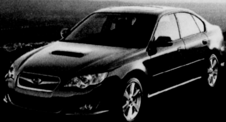
2009 Subaru Legacy 2.5 GT Limited pictured (model 9AK)

2.9% APR for 72 months* on ALL New 2009 Subaru Legacy's