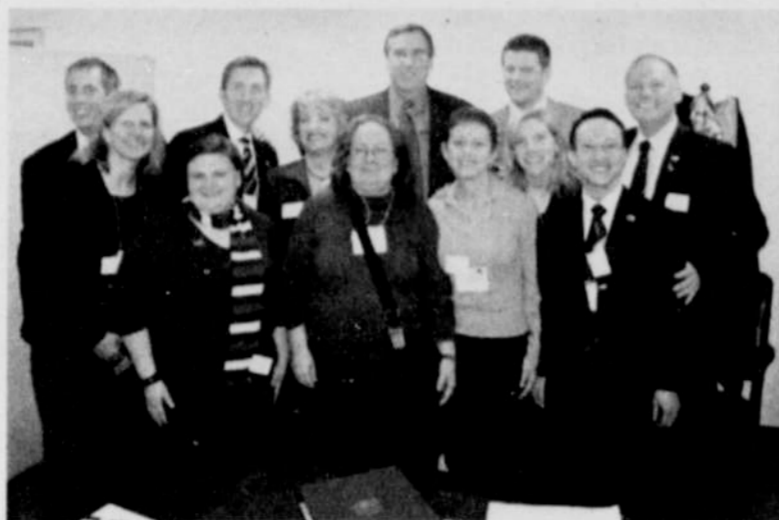
Members of Human Rights Campaign Portland converged on Washington, D.C., for HRC's annual Lobby Day and Equality Convention.

"Our nation's youth deserve the facts about how to protect themselves from sexually transmitted infections, including HIV," said Human Rights Campaign President