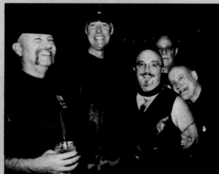
The Eagle Portland is a popular hangout for members of the leather community.