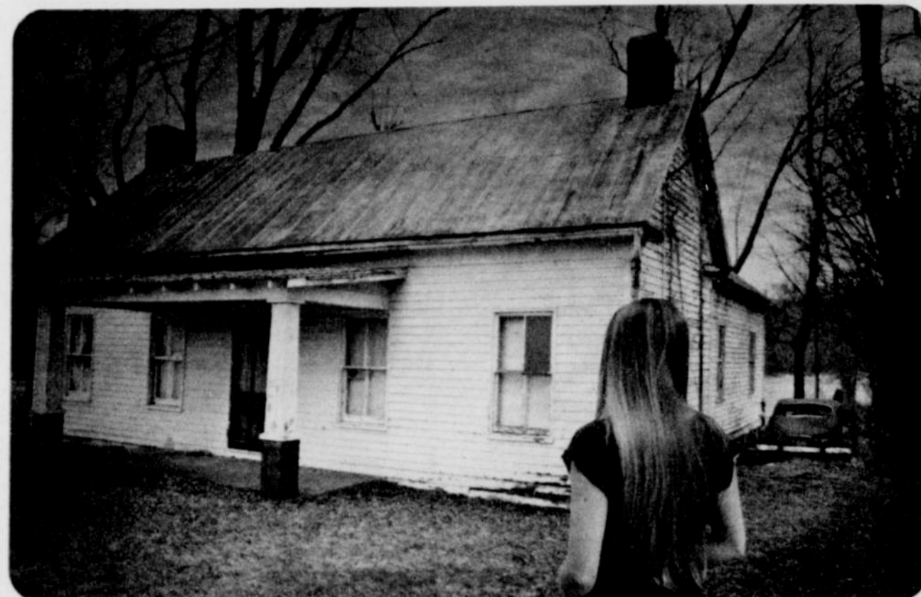
The group photography show Shelter is on display this month at 23 Sandy Gallery.

Manifest presents a free introductory Men's Yogaerobics class to stretch and strengthen your muscles and heart,