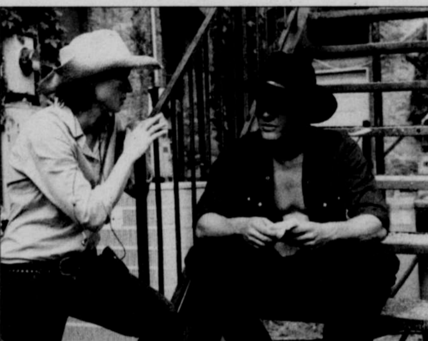
Kimberly Peirce directs Ryan Phillippe on the set of Stop-Loss .

KP: I was most surprised that it crossed over, but that is ultimately what good drama and good characterization should do. There was an ongoing debate about how much "butch lesbian" and how much "transsexual" Brandon was...so, for me, the best thing I could do was...making Brandon