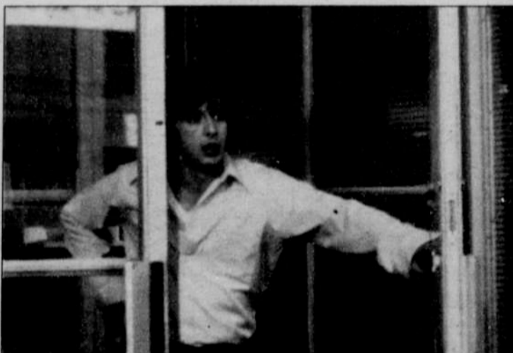
The 1975 classic Dog Day Afternoon had a rare understanding of the ideals of gay liberation.

classic, cinematically speaking, and it offers the added pleasure of its almost unbelievably progressive attitude regarding its queer characters. In fact, mainstream American cinema has rarely been so queer-friendly, even in the years since; this film, released only a few years after the Stonewall riots, was a hit with a major star that had a rare understanding of the ideals of gay liberation.