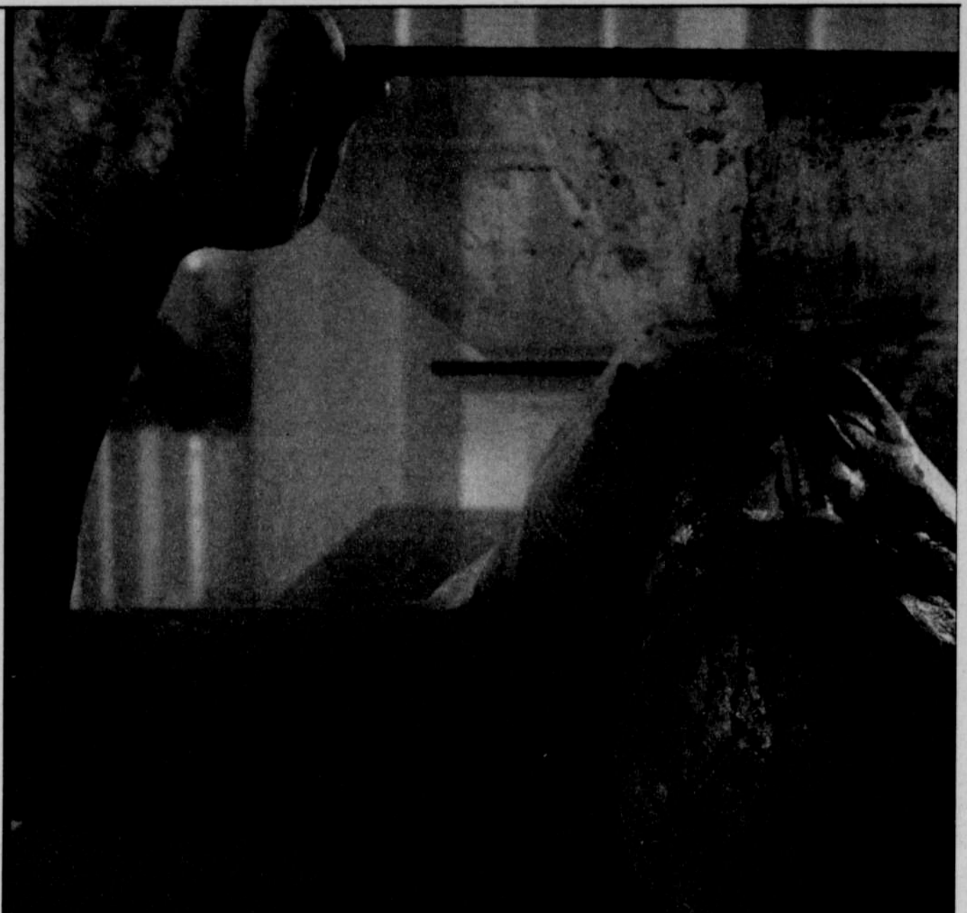
"The sight of your own blood, brought forth from your hand, is a violation that you yourself now control," Ron Athey writes in his online biography.