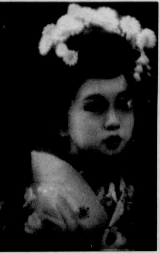
Gay photographer Horace Long's first Portland one-man show is on display through May 2 at Olympic Mills Commerce Building. Check him out April 2 on AM Northwest!

Portland Center Stage's GreenHouse School