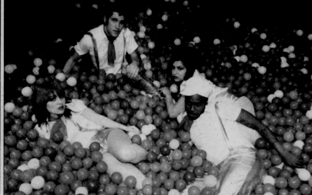
Gravy Train performs March 27 at Rotture.