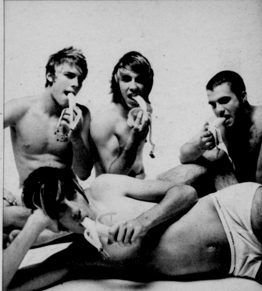
They're not gay, but they sure are cute: Punk-pop quartet All Time Low performs March 28 at Hawthorne Theatre.