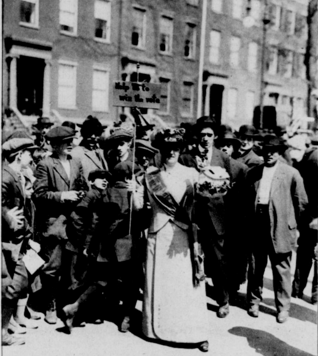
History Image, a new photography and map gallery, exhibits eclectic images dedicated to Women's History Month through March 31.