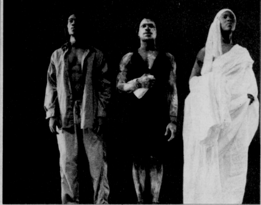
White Bird Dance presents a thrilling collaboration between seven U.S. women and seven Senegalese men April 2 at the Schnitz.

When Mould was in town for Q-LAND/Manifest, we set to him to see if he'd be asked if he wanted to be on the new record, which would be a "district line." What could I say? I've been a punk for as long as I can remember, and I've always been a punk.