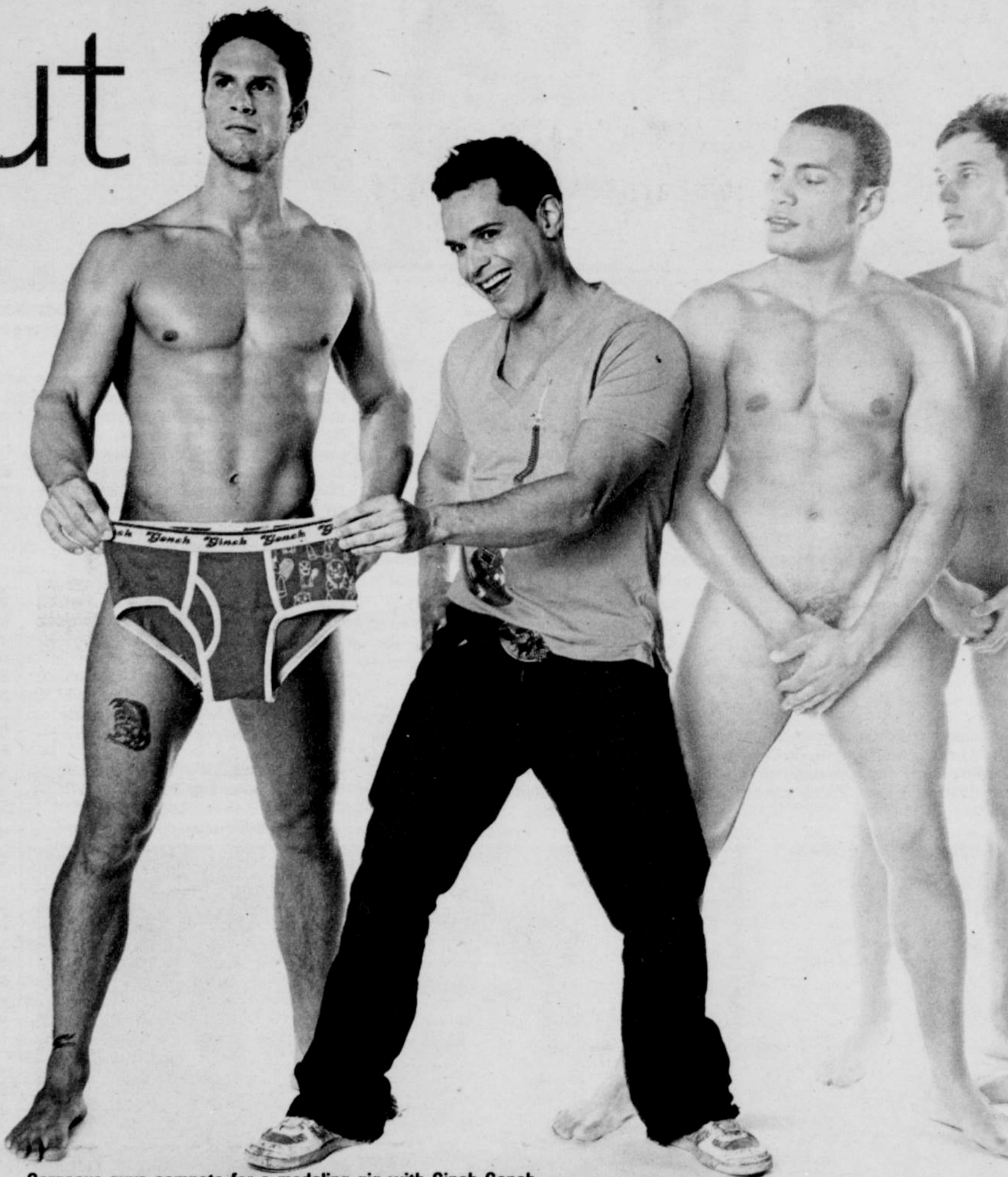
Gorgeous guys compete for a modeling gig with Ginch Gonch underwear in Cover Guy , premiering March 21 on Here.

Coming out, acceptance, rejection...what is your story of transition and transformation? Elder Resource Alliance presents Civil Writes , a workshop in which you will have an opportunity to tell your story and receive an introduction to