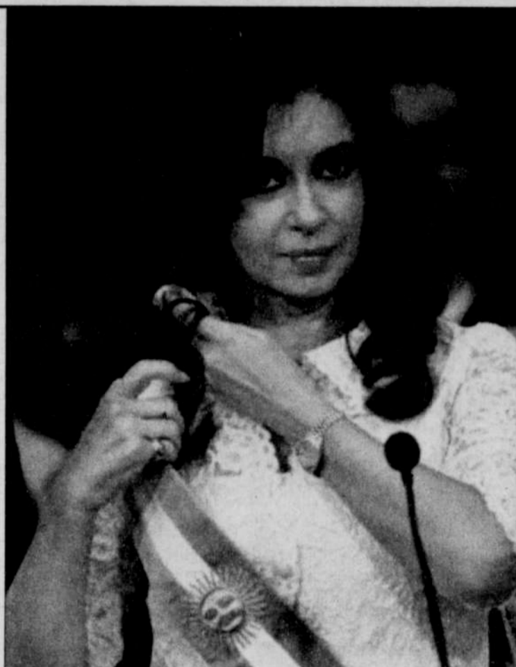
Argentines expect new President Cristina Fernández de Kirchner to support same-sex marriage.

The court said, "If the 1999 constitutional body opted to protect monogamous matrimony between a man and a woman as the essential nucleus