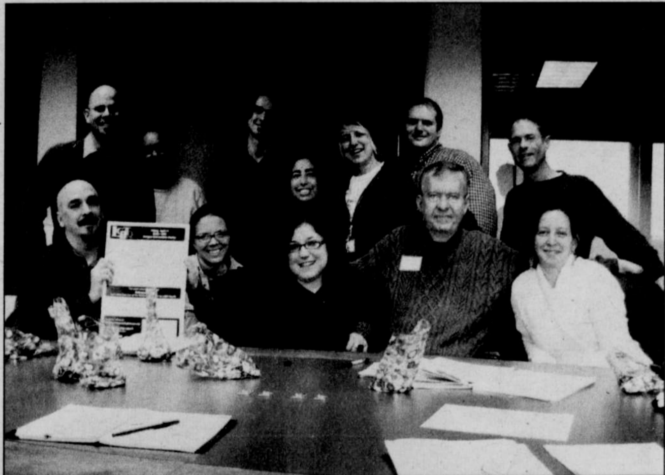
The 2008 Meaningful Care Conference committee brings attention to health care disparities for sexual minorities.